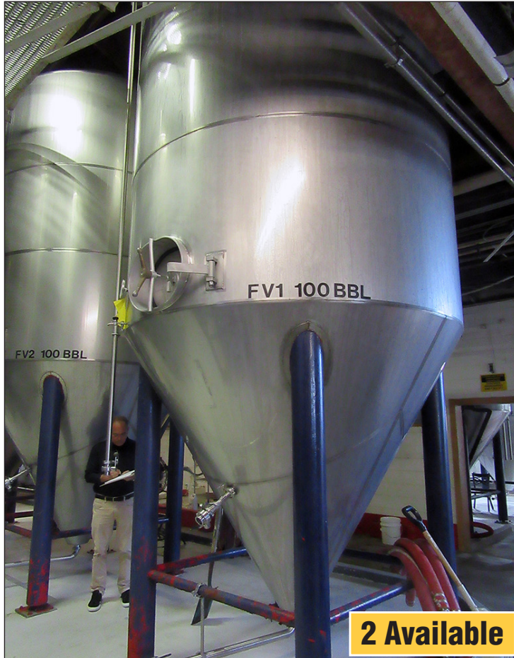
100 bbl S.S. Tanks

2011 Bright Beer Tanks – (1) 200bbl Mueller BBT; Glycol Jacketed; c/w S.S. Carbonating Stone, CIP/Venting Arm and Manual Valves