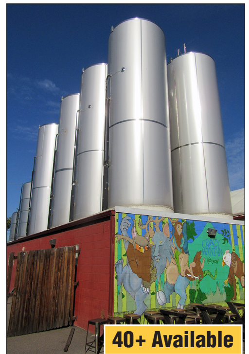
Partial View of S.S. Silos, 300 bbl