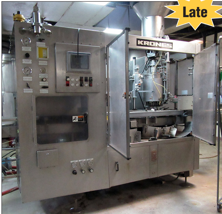
Krones Bottle Filler