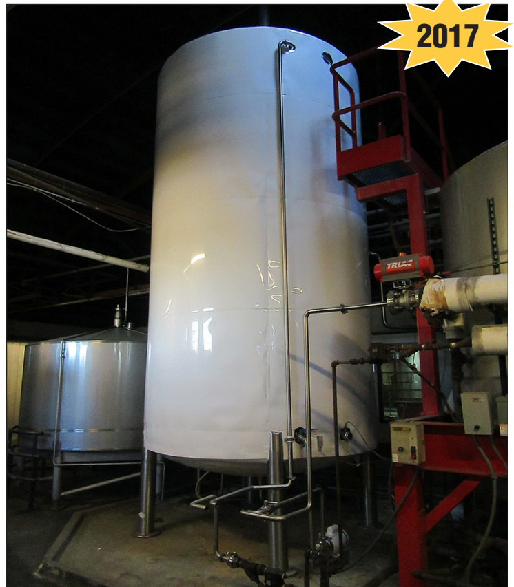
Partial View of Brew House – 175bbl Tank

(2) Grist Augers, 3/4 hp Motors & Flex Augers