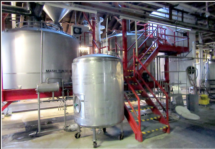
View of Brew House