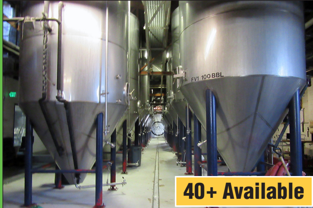
Partial View of S.S. Silos, 100-300 bbl

Timed Online Sale Ending: Wednesday, May 18th at 10:00am CT