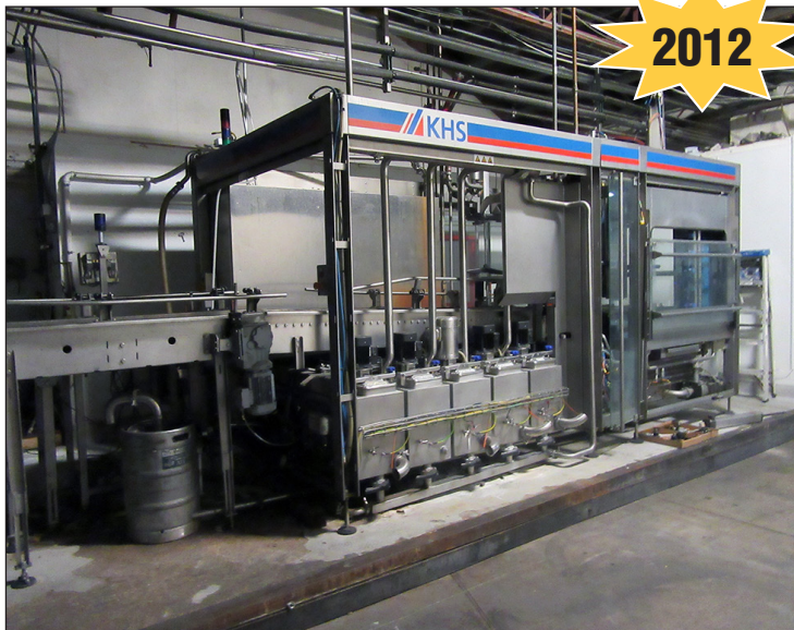
KHS Mono Bloc Keg Washing Line