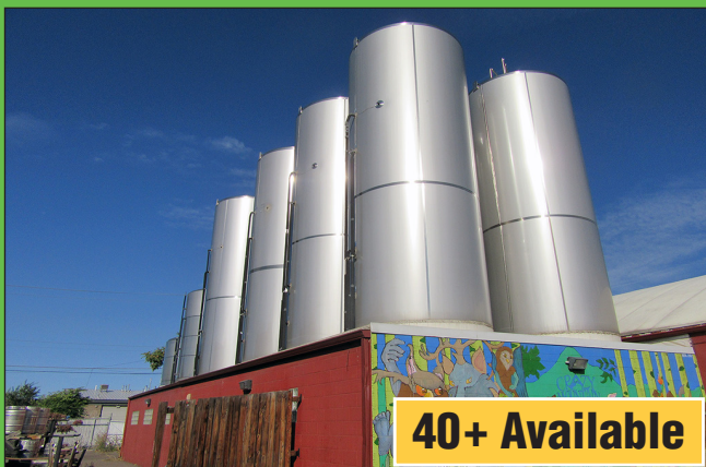
Partial View of S.S. Silos, 300 bbl

Timed Online Sale Ending: Wednesday, May 18th at 10:00am CT