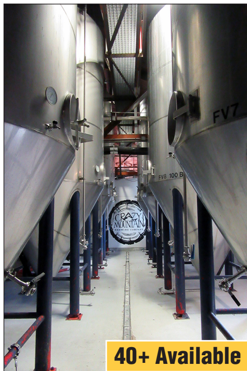
Partial View of S.S. Silos, 100-300 bbl

Unitanks Temp Control System – Separate Individual Temp Controllers per Unitank, Mounted into S.S. Temp Controller Cabinets Beer Transfer Pumps – (2) Portable Baldor Pumps (2HP), w/VFDs