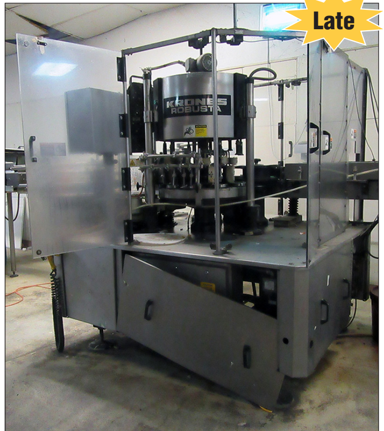
Krones Robusta Neck Labeler