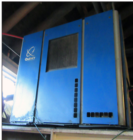
Quincy Rotary Screw Air Compressor