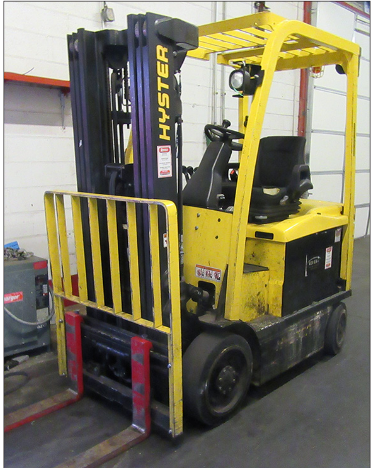
Hyster Electric Forklift

Primary LP Boiler – Ajax Boiler Mod. HNG3000, Refurbished Natural Gas Low Pressure Steam Boiled – Derated by 20% Max Output 1,920,000 BTU/Hr