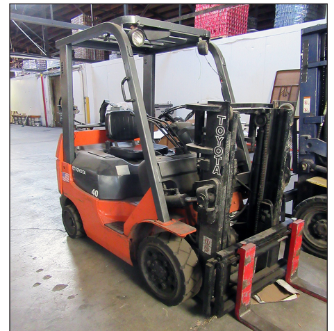
Toyota 40,000lb. Mast Forklift